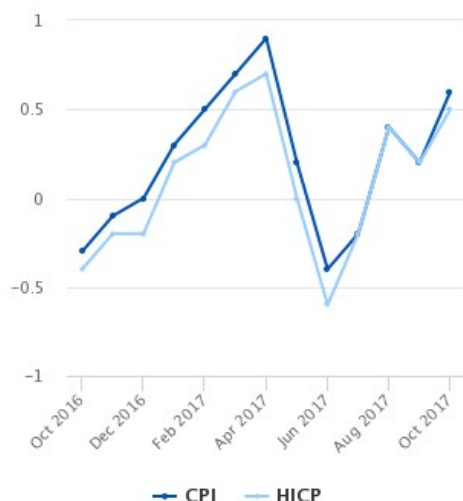
Figure 1: CPI/HICP - ALL ITEMS Annual Percentage Change