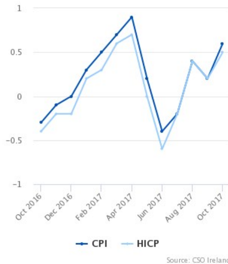
Figure 1: CPI/HICP - ALL ITEMS Annual Percentage Change

Prices on average, as measured by the CPI, were 0.6% higher in October compared with October 2016.